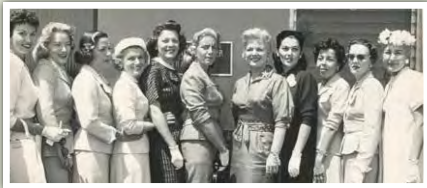
The generous and lovely ladies of SHARE, Inc. circa the 1950s